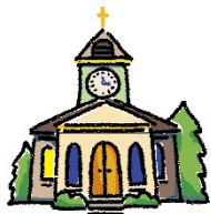
Pastor's Office Hours

May 24 is Pentecost. Be sure to wear red that Sunday!